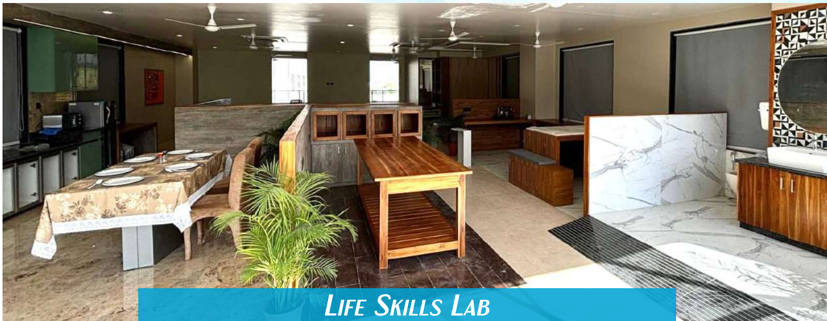
LIFE SKILLS LAB