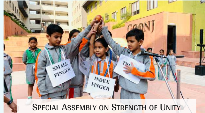
SPECIAL ASSEMBLY ON STRENGTH OF UNITY