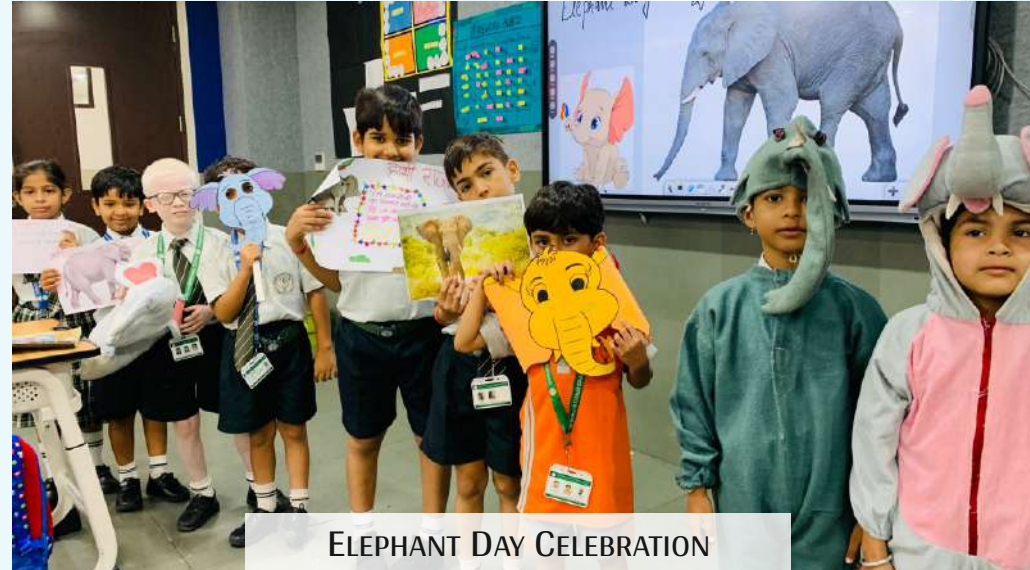
ELEPHANT DAY CELEBRATION