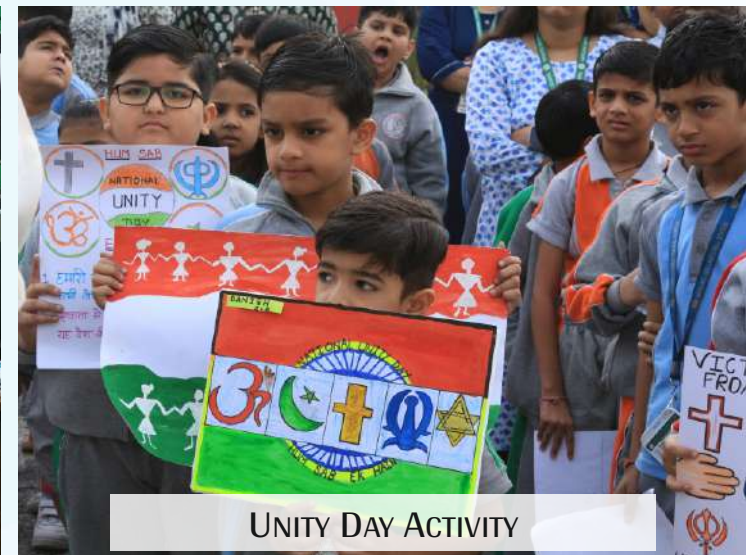
UNITY DAY ACTIVITY