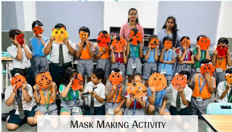
MASK MAKING ACTIVITY

Many creative and innovative activities were conducted in Primary section to promote their cognitive, affective and psychomotor skills.