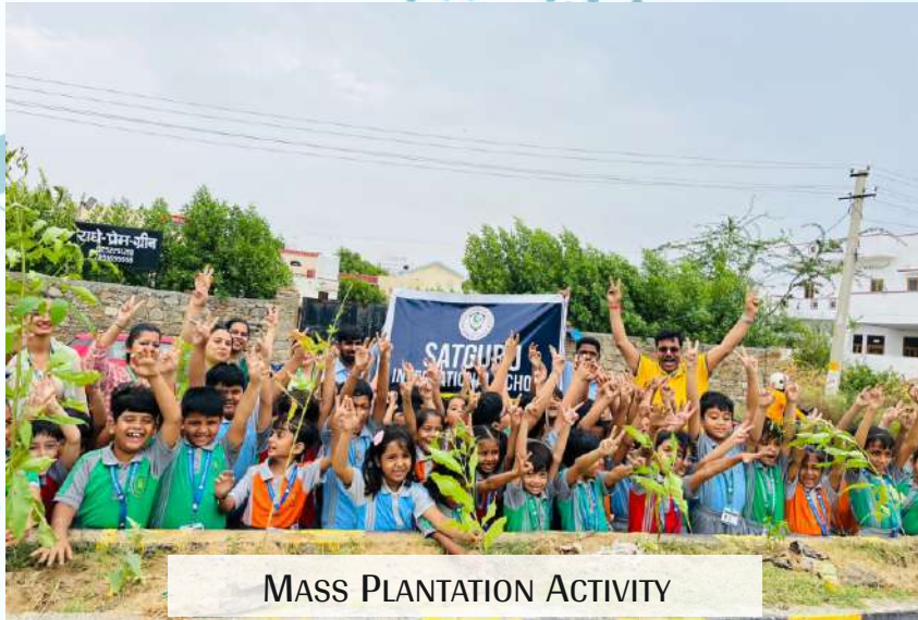
MASS PLANTATION ACTIVITY