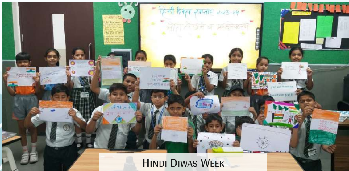
HINDI DIWAS WEEK