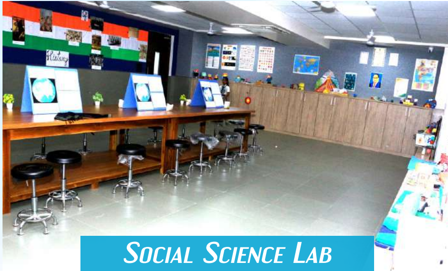
SOCIAL SCIENCE LAB