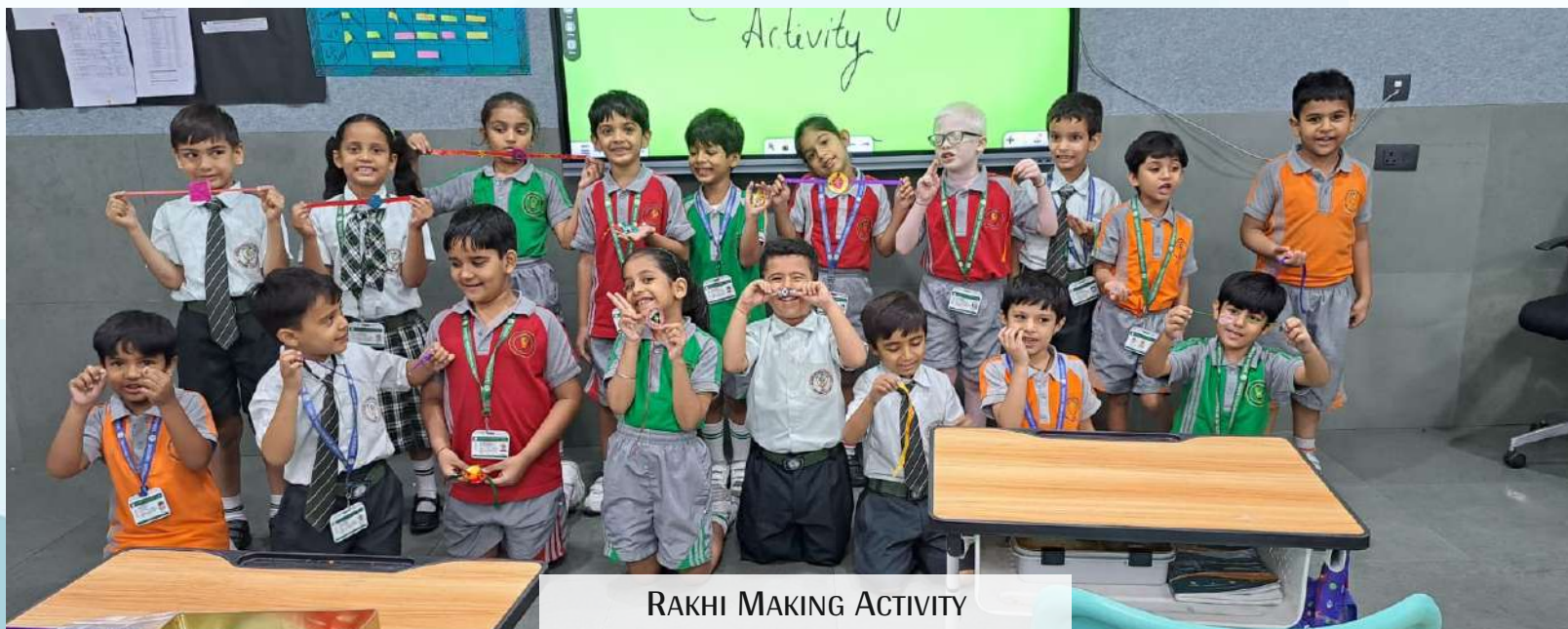
RAKHI MAKING ACTIVITY