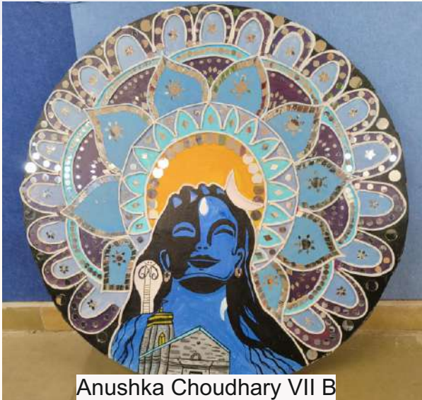
Anushka Choudhary VII B